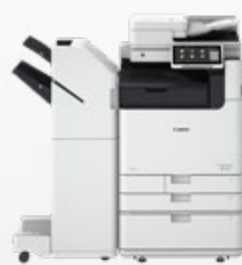
iR-ADV DX 6800