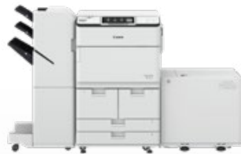
iR ADV DX 8700