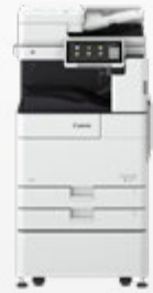
iR ADV DX 4700