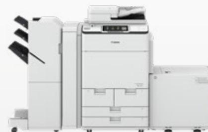
iR ADV DX C7780i