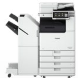
iR ADV DX C3800