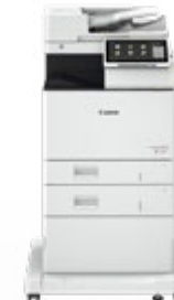
iR ADV DX C478i/iZ