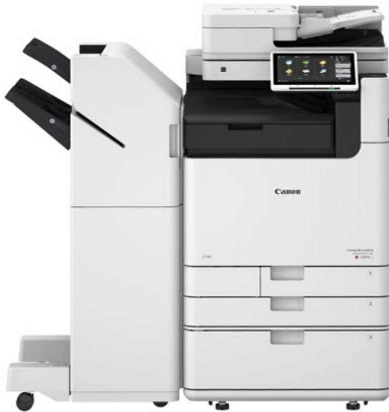
iR ADV DX C5800

The latest imageRUNNER ADVANCE DX C5800 Series produces up to 18% less CO2 and weighs 20% less than its predecessor.