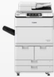
iR ADV DX 6780i