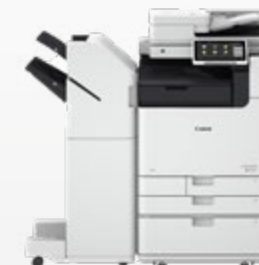
iR ADV DX C5800