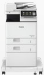
iR ADV DX 717/617/527