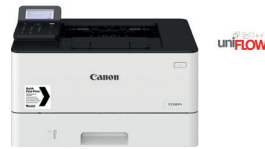
i-SENSYS X 1238Pr