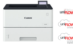
i-SENSYS X 1643P