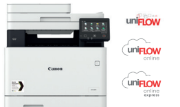
i-SENSYS X C1127i