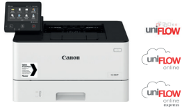
i-SENSYS X 1238P