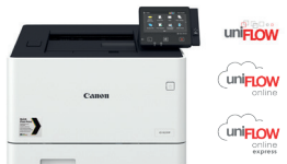
i-SENSYS X C1127P