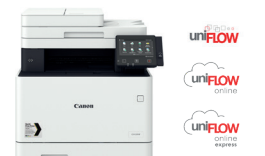
i-SENSYS X C1127iF